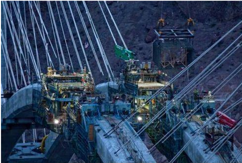
Joining requires extremely careful work!

as the "them" shows. Otherwise, if it referred to Adam, would it exclude Eve from being a created human being? Furthermore, saying "male and female", 43 God also emphasized that he blessed these people such that they would fill the earth. 44 At the same time, the close personal love relationship between a man and his wife is sanctified to serve as a metaphor for the relationship between God and his people and between Christ and his Church. 45