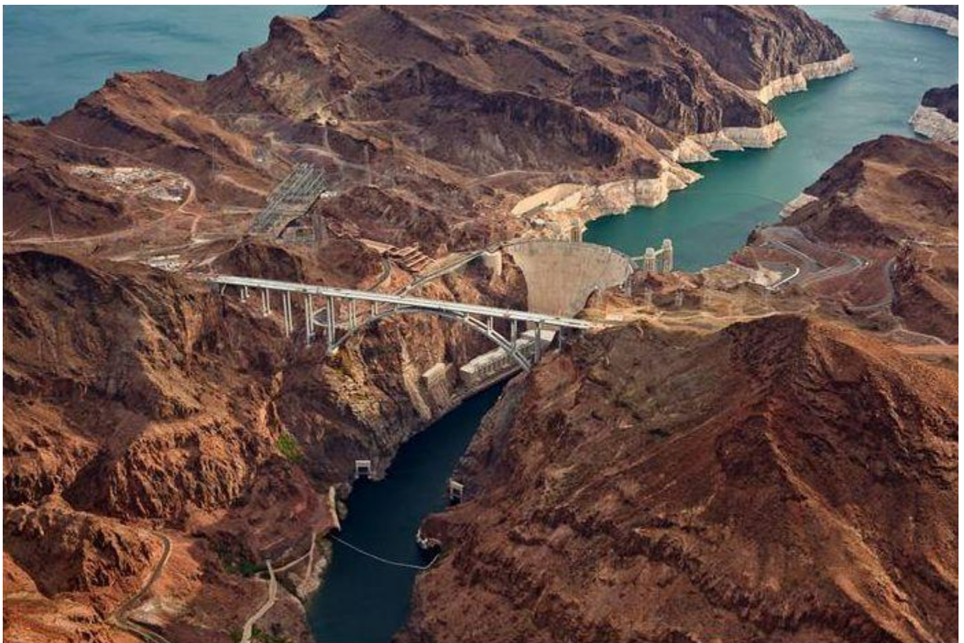
How beautiful - two-way communication!

So what about pre-adamite humans who were real humans according to Genesis 1:27? What about those among today's humans who are neither descendants of Adam nor heard the OT messianic promises or the gospel of Christ's substitutionary atonement? Together with Adam's descendants, they all bear the image of God with all its implications and consequences. There is only one human "race" or species: we must not make any distinctions of eligibility for any spiritual goods between them. Genesis 1:27 therefore must describe an event which occurred long before Adam's time, and Adam's fall cannot have any influence on these pre-adamite or otherwise non-adamite humans.