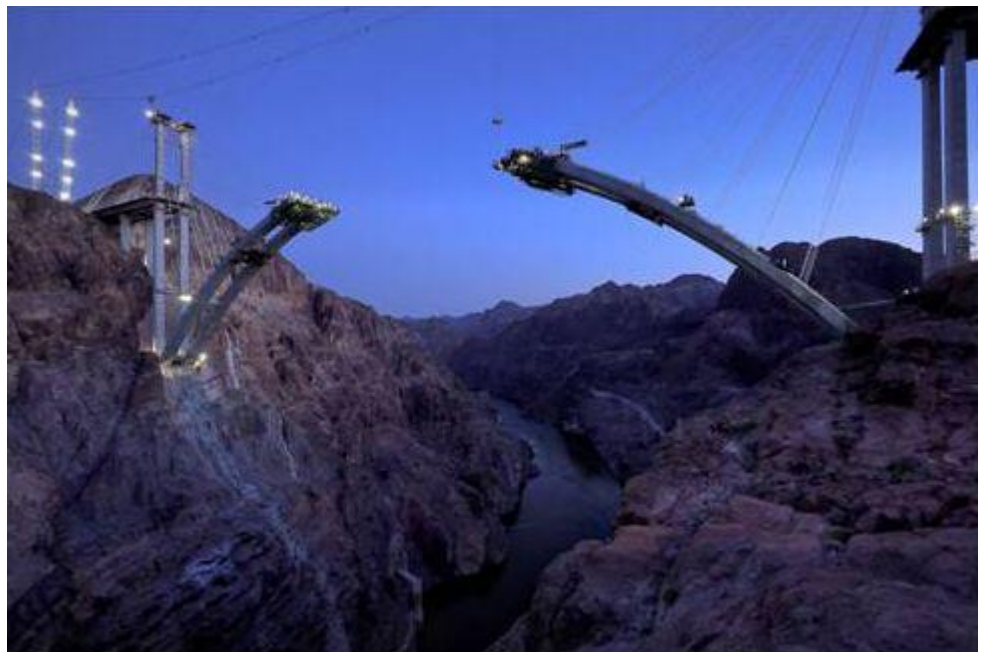
No, the others are also beginning to do so!

Archeology suggests that before about 35,000 YBP, there was an "awakening" of Homo sapiens with emotional, religious, cultural, communal, agricultural, organizational, economical, intellectual, technical, and artistic aspects, which was then displayed in Western Europe. If this corresponded to a spiritual event, 21 it may have been a supernatural divine input, superimposed at a given moment on the biological evolution of modern Homo sapiens, rather than an accidental "awakening" of the rational mind. This special event would have occurred somewhat earlier in Africa in a probably very small community.